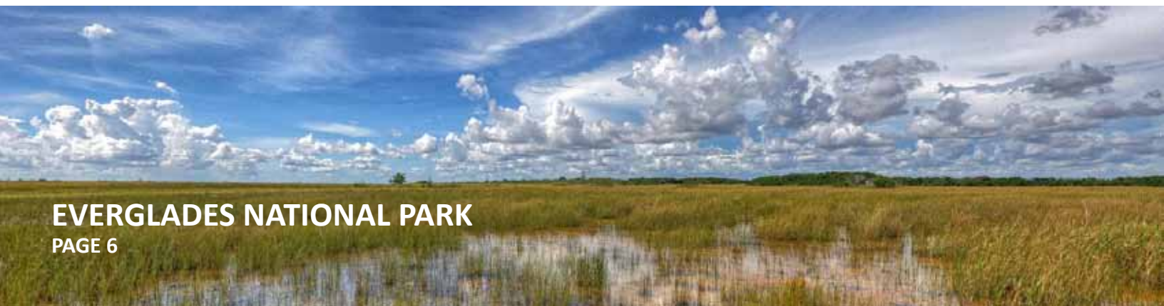
EVERGLADES NATIONAL PARK PAGE 6