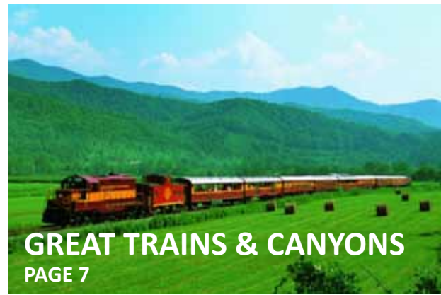
GREAT TRAINS & CANYONS PAGE 7