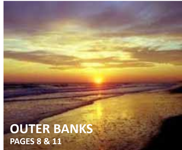
OUTER BANKS PAGES 8 & 11